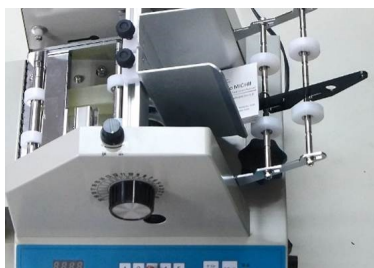
Business cards 55mm x 90 mm