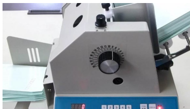
Direct access to speed adjustment & Thickness dials