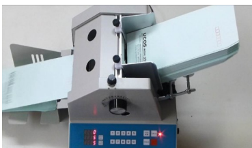
Certain types of envelopes (SEF)