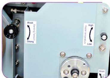
Easily adjustable heating temperature and